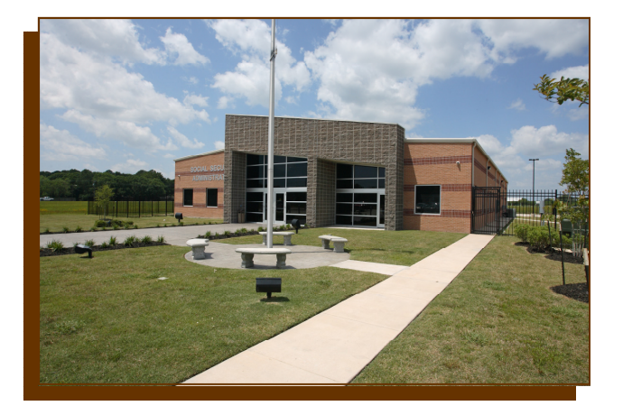
WM Dillard & Associates, L.P.